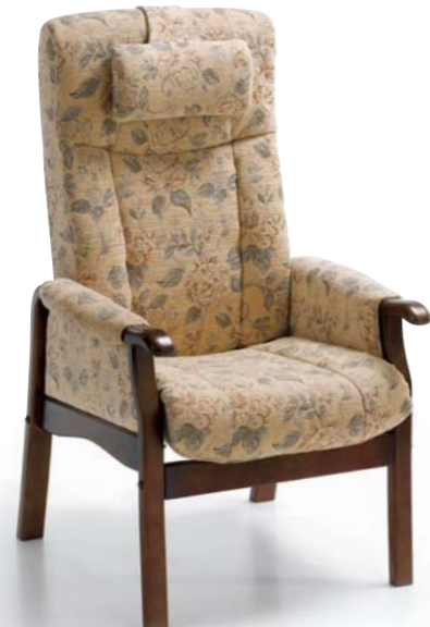
JULIET glide glide The Action moves more freely with your body, backwards and forwards. This is a totally unique feature for these products. A- 67 B-111 C- 48 D- 46