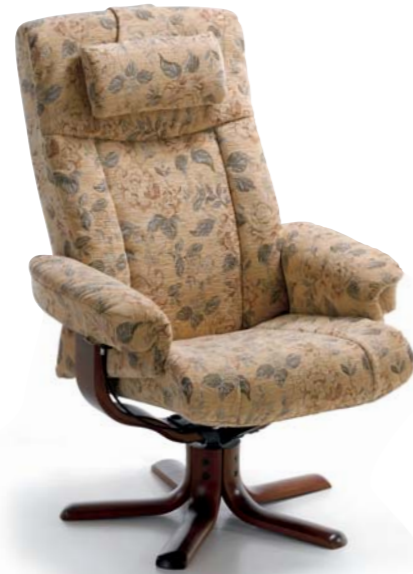
JULIET swivel chair swivel chair and stool The ultimate in comfort today. Complete 360-degree turn, on a solid timber, star base, with wire or simple easy glide performance to choose from. A- 77 B-108 C- 79 D- 45