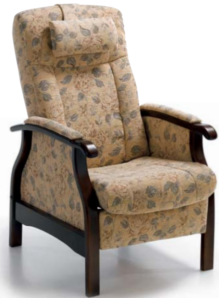
JULIET recliner Push and motorised recliner A simple 3 position, push back system to recline. Can be motorised with a single motor to stop and start the reclining action. The understandable handset controller is very user friendly. A- 67 B-111 C- 52 D- 46