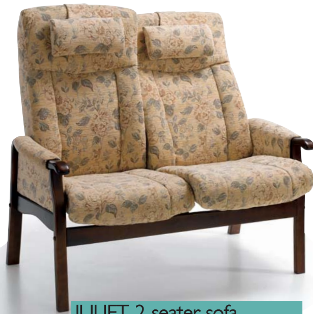
JULIET 2 seater sofa glide sofa The sofa can be 2 or 3 seats, with the same back as the glide chair. The detail on the back cushions, blend well with all the products within this collection. A- 124 B-111 C- 48 D- 46